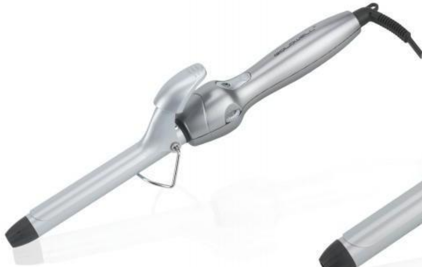
CT-607A Ø19mm CURLING TONG