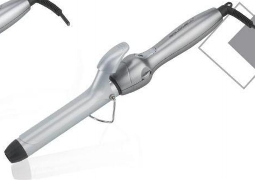
CT-607B Ø25mm CURLING TONG