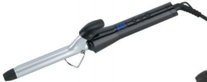
CT-608A Ø19mm CURLING TONG