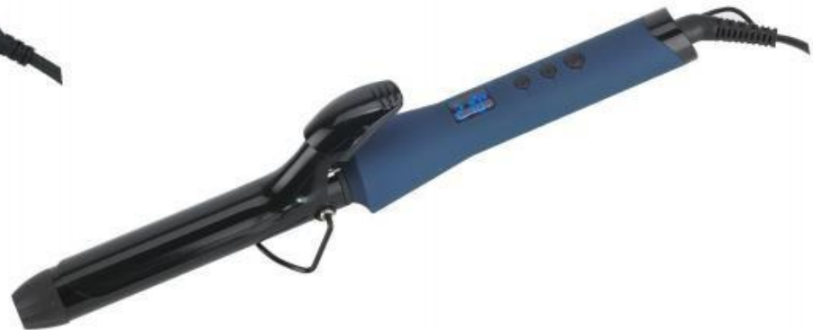
CT-608B Ø25mm CURLING TONG