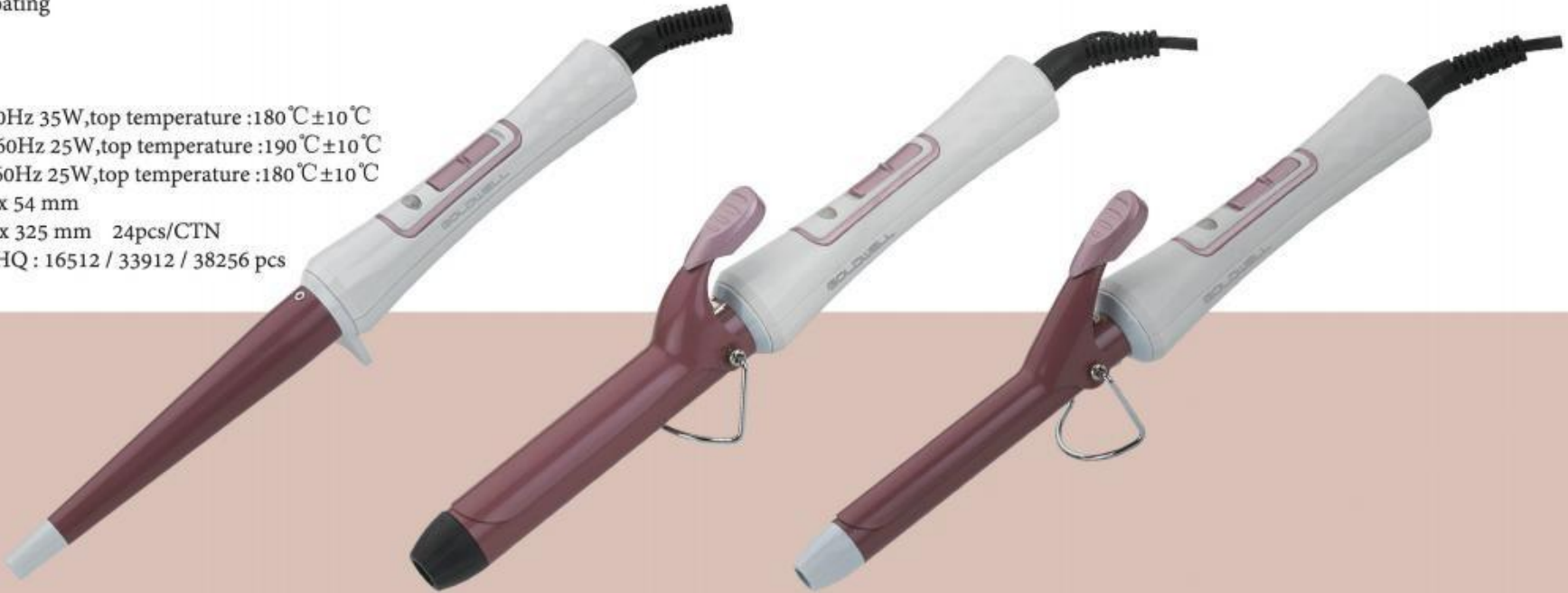
CT-603 CONICAL IRON