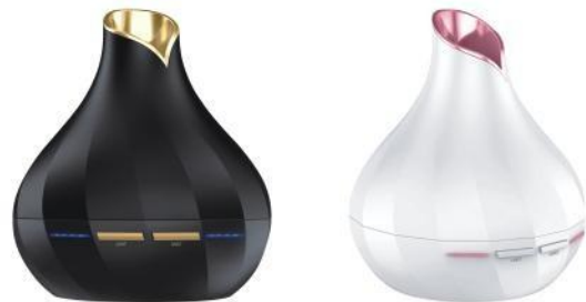
WUH003 / WUH003E