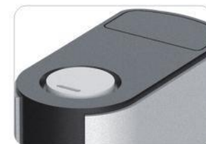
WUH013 / WUH013E