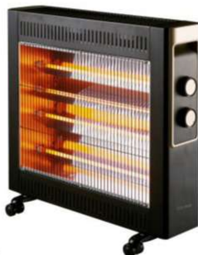
NSBK-220B21-1 Quartz Heating Element NSBK-220B25-1 Carbon Heating Element

G.W/N.W: 5.1KG/4.1KG POWER: 2200W WATERPROOF GRADE: IPX4 COLOR: WHITE SIZE: 530x180x580mm 40HQ: 1200PCS