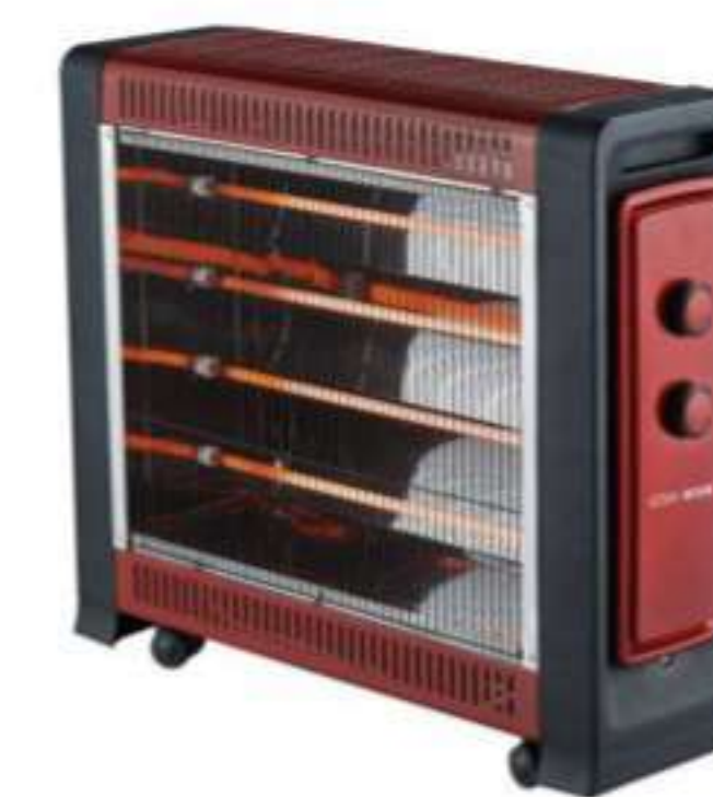
NSBK-220D21 Quartz Heating Element