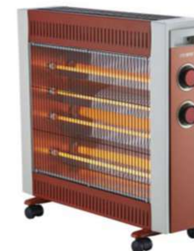
NSBK-220F21 Quartz Heating Element