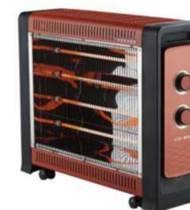
NSBK-220G21 Quartz Heating Element