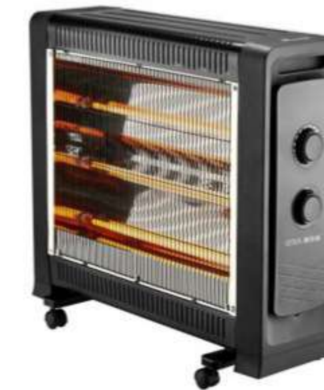
NSBK-240GC21F Quartz Heating Element