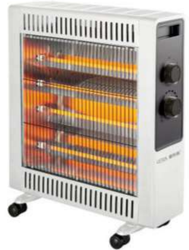
NSBK-220H21-1 Quartz Heating Element NSBK-220H25-1 Carbon Heating Element

G.W/N.W: 5.8KG/4.8KG POWER: 2200W WATERPROOF GRADE: IPX4 COLOR: BLACK SIZE: 570x180x590mm 40HQ: 1040PCS