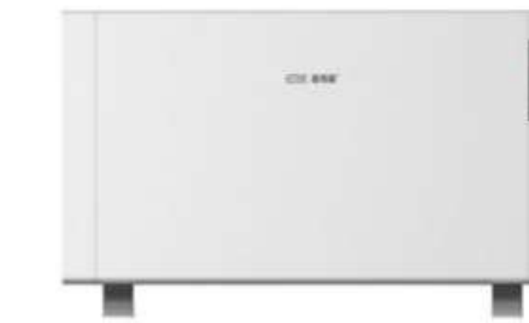
NSCA-200SF Digital Type Convection Heater G.W/N.W: 5.5KG/4.5KG POWER: 2000W SIZE: 800X140X510mm 40HQ: 1170PCS