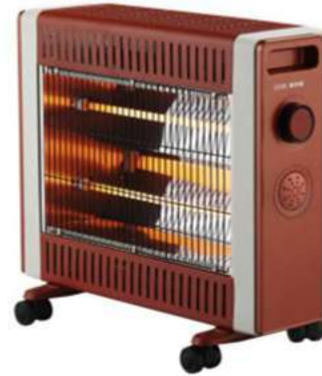
NSBK-150J21 Quartz Heating Element NSBK-150J25 Carbon Heating Element

G.W/N.W: 5.1KG/4.1KG POWER: 2200W WATERPROOF GRADE: IPX4 COLOR: BLACK&ORANGE SIZE: 530x180x580mm 40HQ: 1200PCS