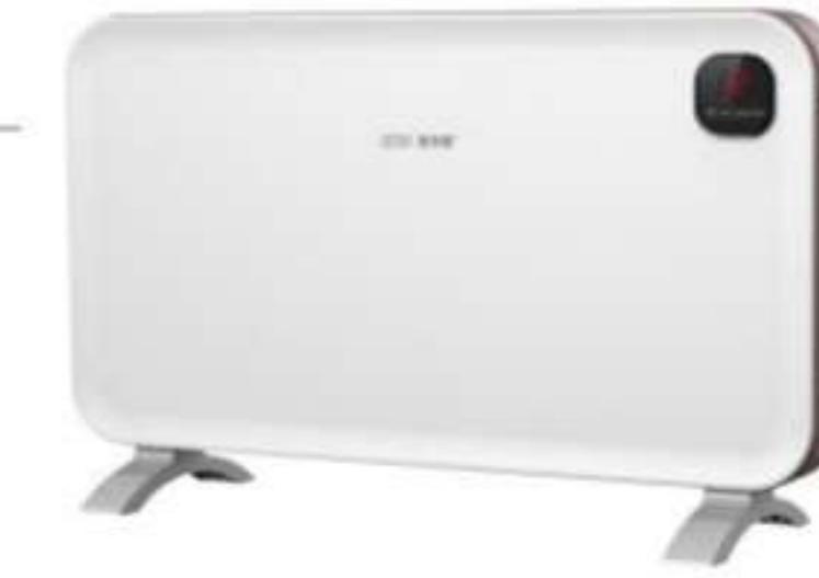
NSCA-200SE Digital Type Convection Heater G.W/N.W: 5.5KG/4.5KG POWER: 2000W SIZE: 800X140X520mm 40HQ: 1170PCS