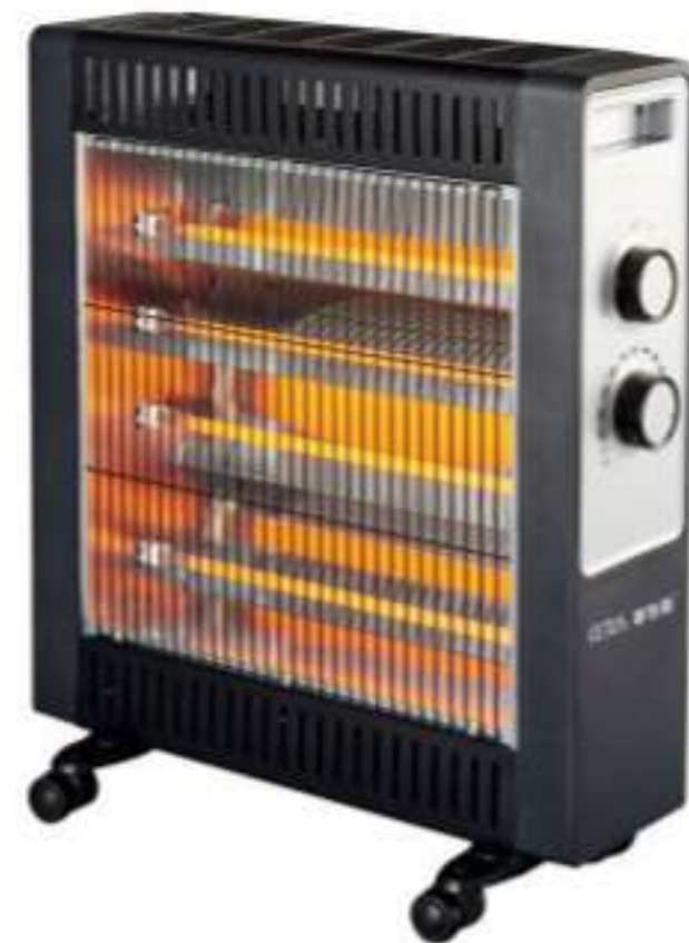
NSBK-220H21-2 Quartz Heating Element NSBK-220H25-2 Carbon Heating Element

G.W/N.W: 5.1KG/4.1KG POWER: 2200W WATERPROOF GRADE: IPX4 COLOR: WHITE SIZE: 530x180x580mm 40HQ: 1200PCS