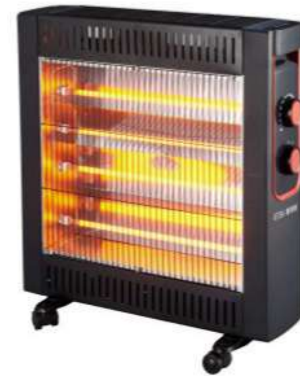
NSBK-220A21-1 Quartz Heating Element NSBK-220A25-1 Carbon Heating Element

G.W/N.W: 6.2KG/5.4KG POWER: 2200W WATERPROOF GRADE: IPX4 COLOR: RED&BLACK SIZE: 685x245x580mm 40HQ: 695PCS