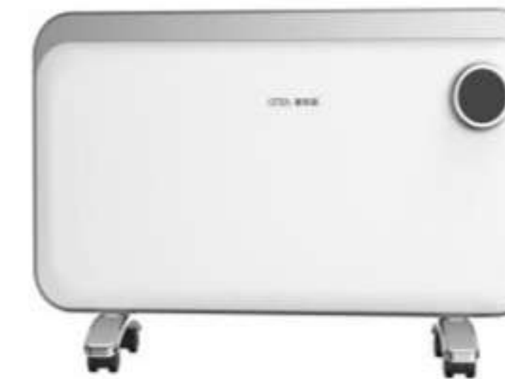
NSCA-200SM Digital Type Convection Heater G.W/N.W: 5.5KG/4.5KG POWER: 2000W SIZE: 800X140X520mm 40HQ: 1170PCS