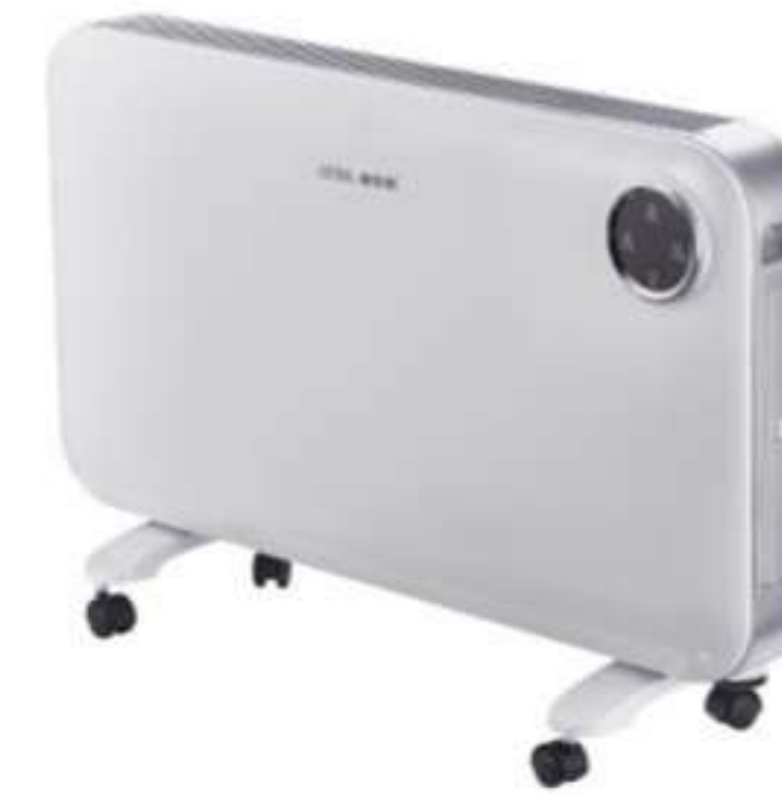
NSCA-200SD Digital Type Convection Heater G.W/N.W: 5.5KG/4.5KG POWER: 2000W SIZE: 800X140X520mm 40HQ: 1170PCS

G.W/N.W: 5.1KG/4.1KG POWER: 2200W WATERPROOF GRADE: IPX4 COLOR: BLACK&ORANGE SIZE: 540x180x580mm 40HQ: 1180PCS