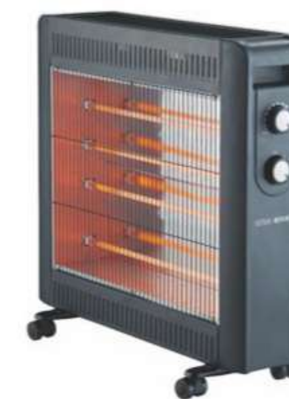
NSBK-220B21 Quartz Heating Element