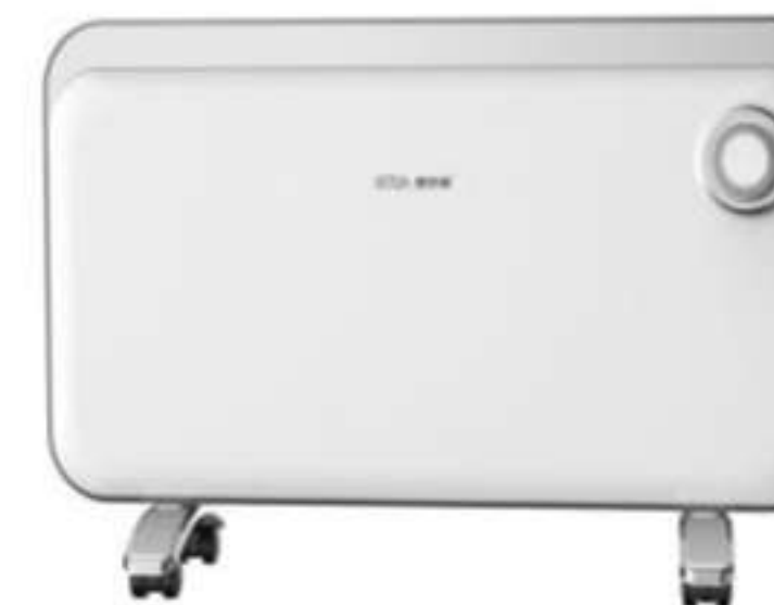
NSCA-200SM-T Key-press Type Convection Heater G.W/N.W: 5.5KG/4.5KG POWER: 2000W SIZE: 800X140X520mm 40HQ: 1170PCS