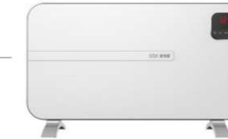
NSCA-200SG Digital Type Convection Heater G.W/N.W: 5.5KG/4.5KG POWER: 2000W SIZE: 800X140X520mm 40HQ: 1170PCS