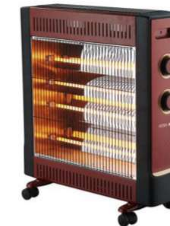
NSBK-220E21 Quartz Heating Element