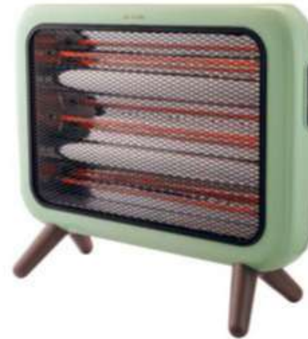
NSEA-150A1-1 Quartz heater