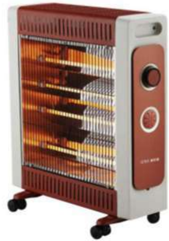
NSBK-220H21 Quartz Heating Element NSBK-220H25 Carbon Heating Element

G.W/N.W: 5.1KG/4.1KG POWER: 2200W WATERPROOF GRADE: IPX4 COLOR: BLACK&ORANGE SIZE: 530x180x580mm 40HQ: 1200PCS