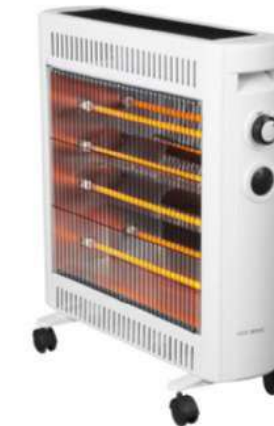
NSBK-220A21 Quartz Heating Element