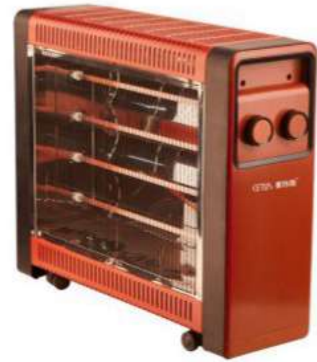
NSBK-220M21 Quartz Heating Element NSBK-220M25 Carbon Heating Element

G.W/N.W: 4.1KG/3.1KG POWER: 1500W WATERPROOF GRADE: IPX4 COLOR: BLACK&ORANGE SIZE: 530x180x440mm 40HQ: 1580PCS