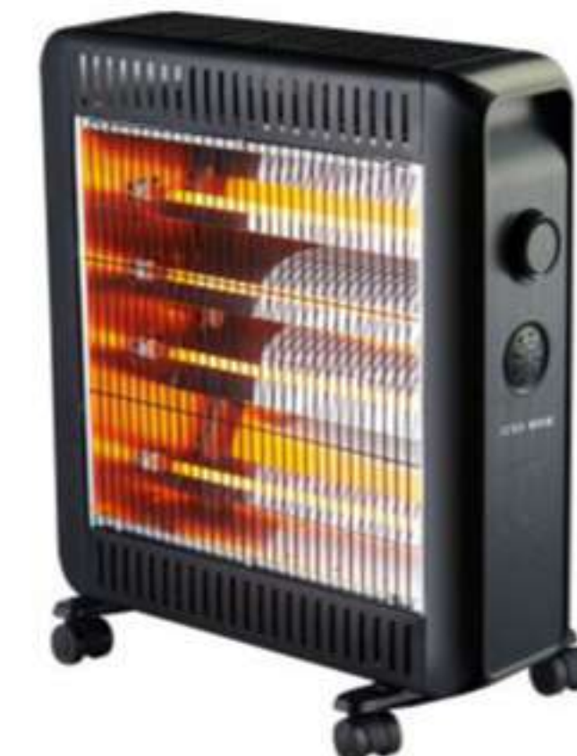
NSBK-220Y21 Quartz Heating Element NSBK-220Y25 Carbon Heating Element

G.W/N.W: 6.5KG/5.5KG POWER: 2200W WATERPROOF GRADE: IPX4 COLOR: BLACK&RED SIZE: 660x180x590mm 40HQ: 930PCS