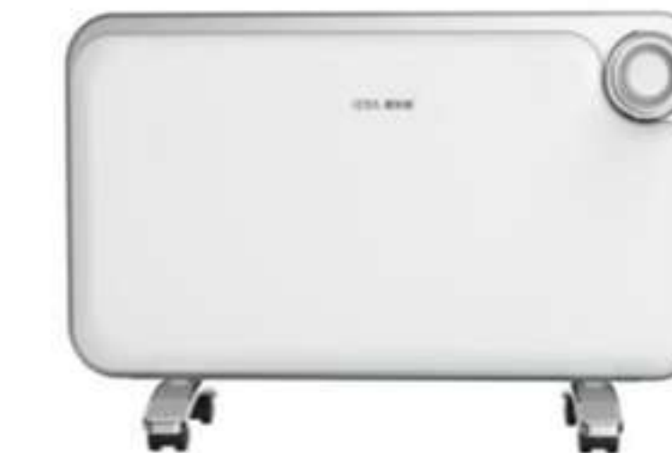
NSCA-200SK-T Key-press Type Convection Heater G.W/N.W: 5.5KG/4.5KG POWER: 2000W SIZE: 800X140X520mm 40HQ: 1170PCS