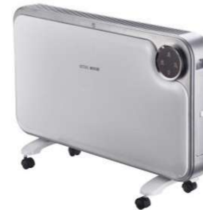
NSCA-200SK Digital Type Convection Heater G.W/N.W: 5.5KG/4.5KG POWER: 2000W SIZE: 800X140X520mm 40HQ: 1170PCS