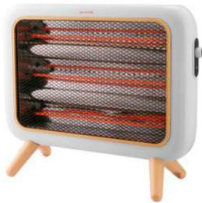
NSE-150A1 Quartz heater